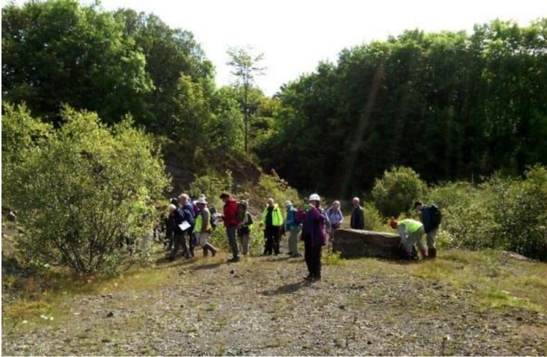
Examining the large rock .locality 1

We entered the site, with high hope of interesting finds, from the Southern Bay and first looked at the remains of the Lower Carboniferous coal seam at locality 1 before going to the other side of the water (locality 2) to examine some very large blocks of rock. These proved to be packed with the fossil remains of crinoids, brachiopods and other fauna indicating a rich fertile environment in this area while it was still at the southern edge of Laurussia.