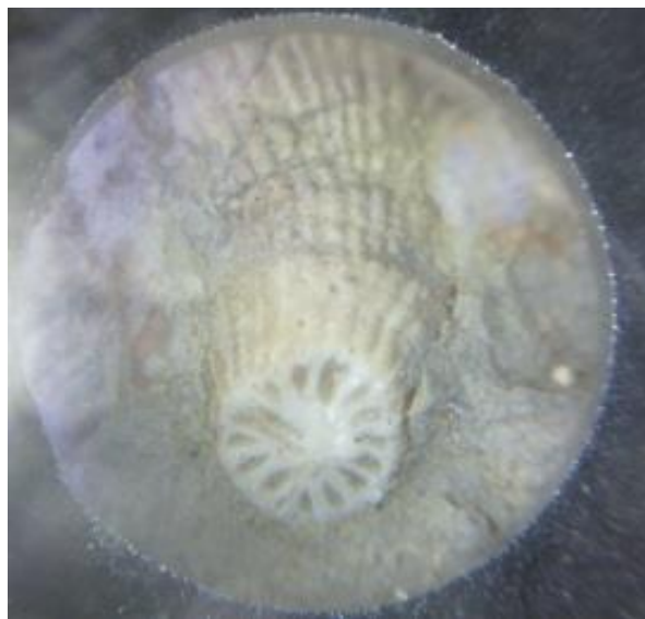
Magnified photo of solitary coral

We were taking photos mostly with our phones and, being well prepared, Al had brought with him a few phone camera magnifiers one of which was used to photograph this coral..