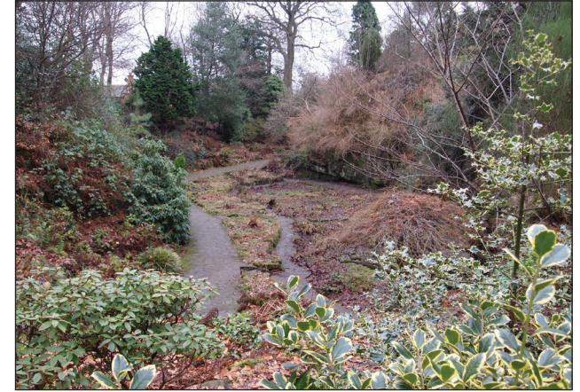
Quarry Knowe Rock Gardens

About 30 million years later an episode of volcanic activity resulted a thin sheet of molten rock (dolerite) being intruded into the rocks and can be seen cutting through some of the trunks. The dolerite (formerly known as whinstone) was quarried in the 19th century for roadstone.