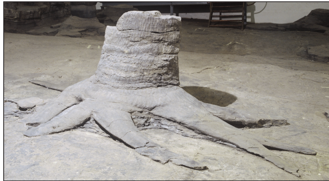
One of the Fossil Trees

centimetres tall. There is also a large trunk lying across the floor of the quarry as well as several smaller pieces of branch and root. The tree stumps were buried by sand in their life position and ripple marks on some of the beds provide evidence of river currents moving to the south-west between the trunks. Through time the sand turned to sandstone and the outer parts of the stumps became thin coatings of coal.