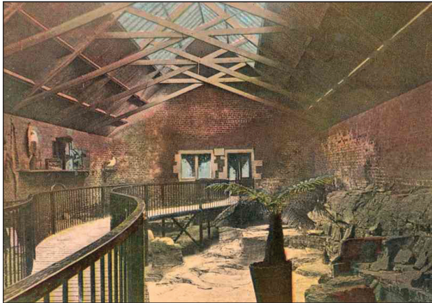
Interior of the Fossil House c.1910

The Partick Burgh Commissioners decided not to take the fossils to a museum but to leave them where they were and preserve them as a public attraction within a specially erected building which opened on January 1st 1890.