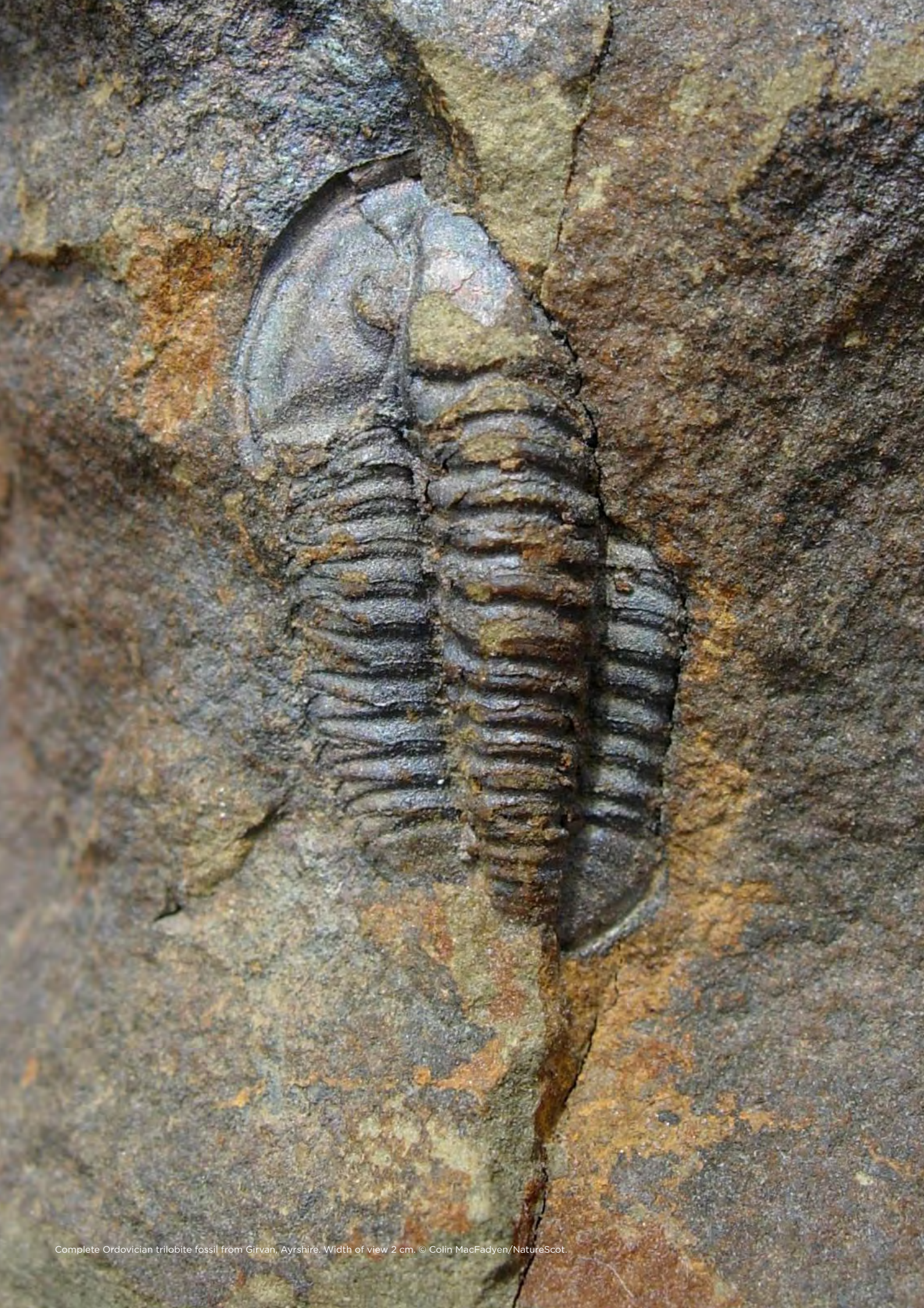
Complete Ordovician trilobite fossil from Girvan, Ayrshire. Width of view 2 cm.