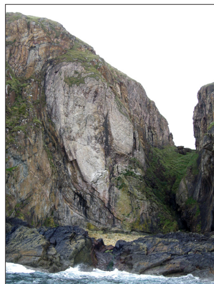
'The Bubble' on Holy Isle. An enormous isoclinally folded glaciotectionic 'raft' derived from the underlying Garbh Eileach Formation which has been incorporated into the Great Breccia of the Port Askaig Formation.